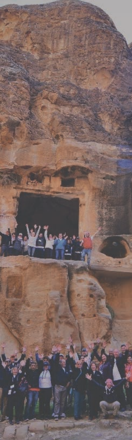
Image: A group of travelers stand in front of Little Petra, Jordan.