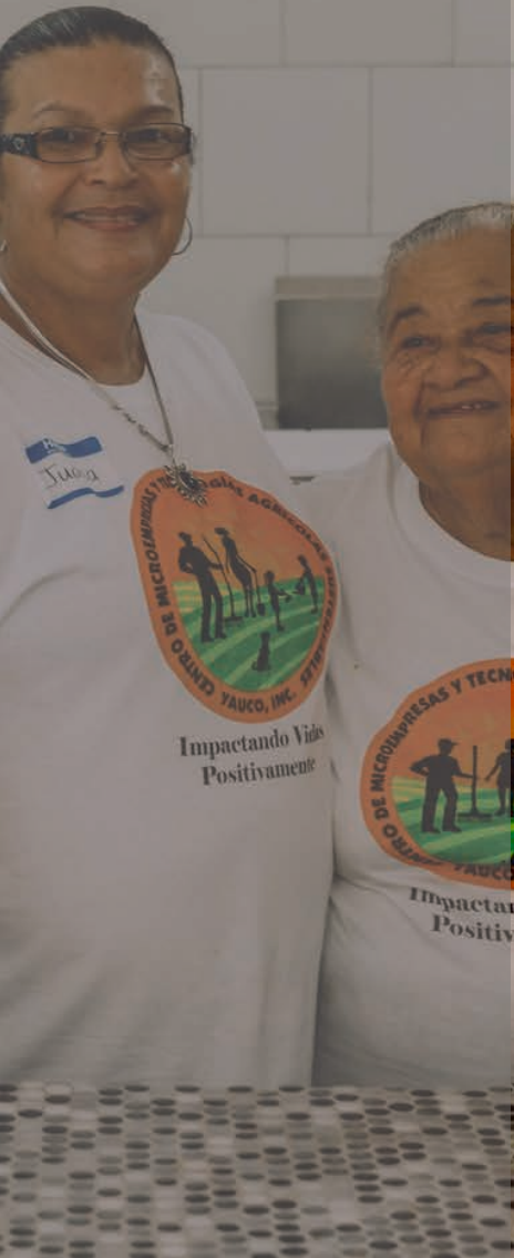
Image: Two Puerto Rican women smiling at the camera.