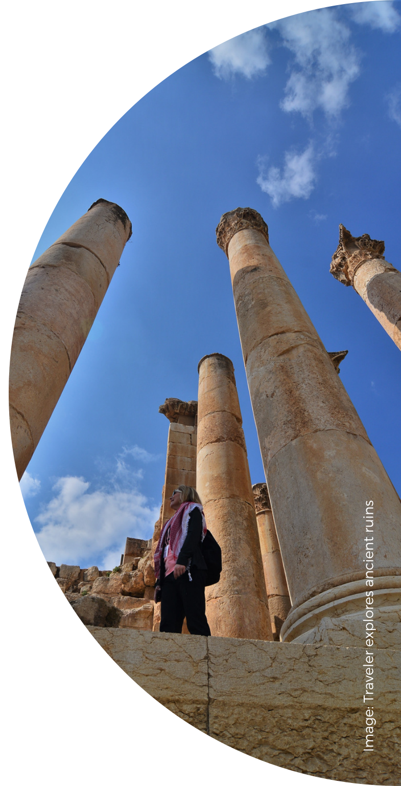
Image: Traveler explores ancient ruins

The mission of Tourism Cares is to unite the travel industry and be a catalyst of positive social, environmental and economic impact for the people and places of travel.