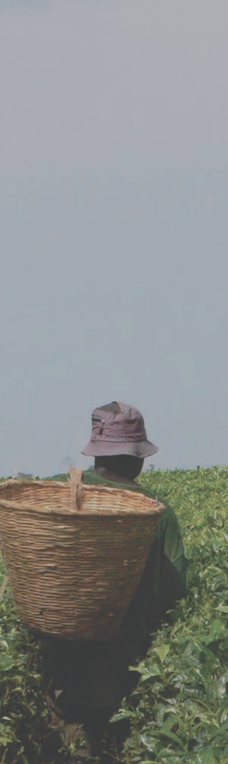
Image: A farmer wearing a basket on their back, harvests tea in a field, Uganda.

MSME: micro, small, and medium sized enterprises. Tourism Cares defines micro, small, and medium sized enterprises to have a talent pool of <10, <50, <250 respectively.