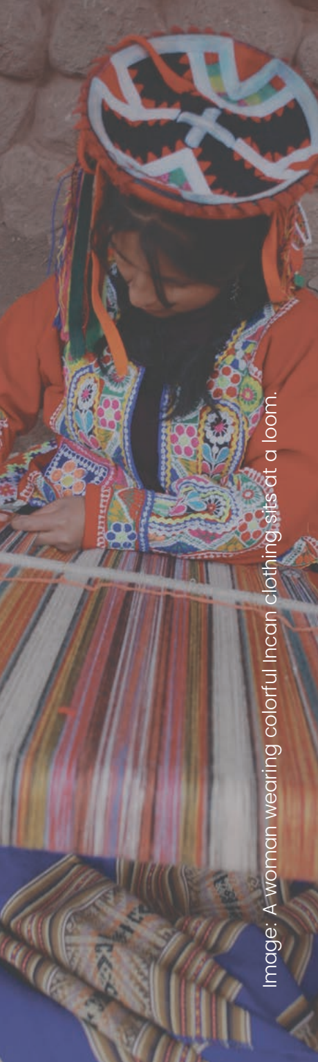
Image: A woman wearing colorful Incan clothing sits at a loom.