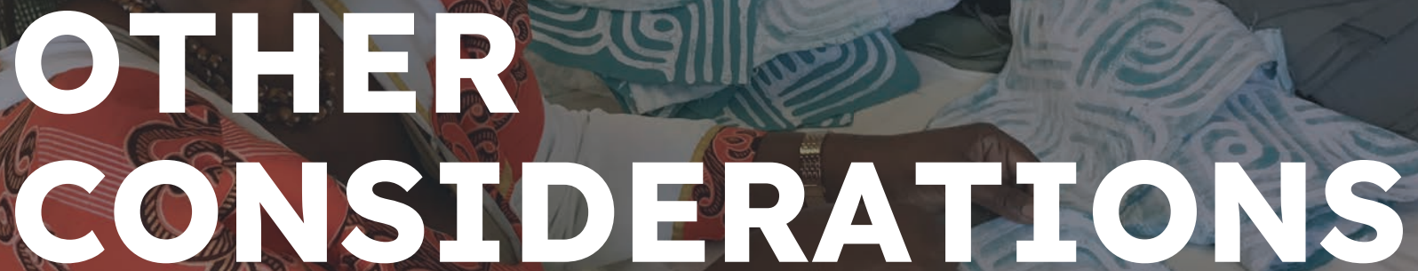
Image: A Namibian woman wearing a colourful dress and hat, sits at a table ironing textiles.