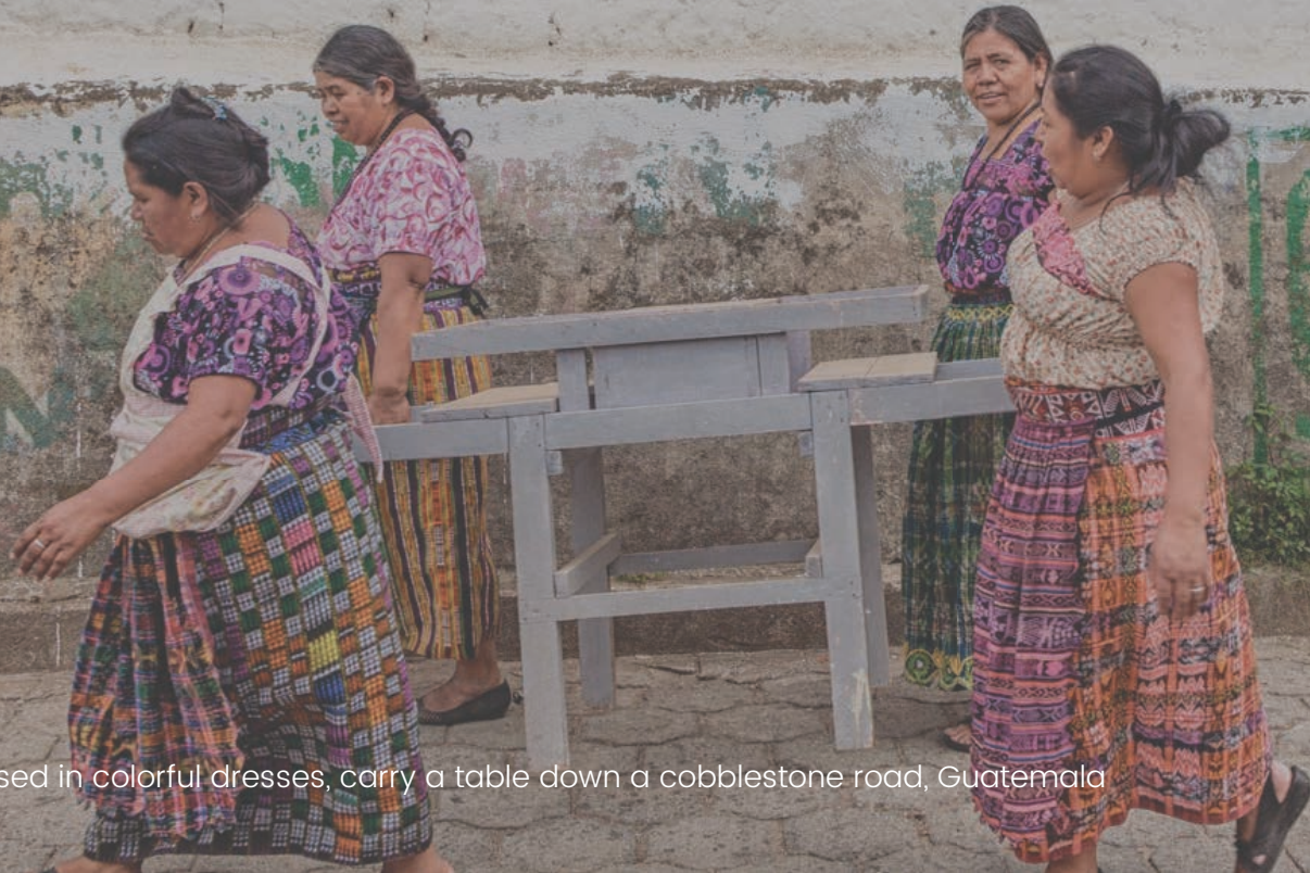
Image: Four women, dressed in colorful dresses, carry a table down a cobblestone road, Guatemala