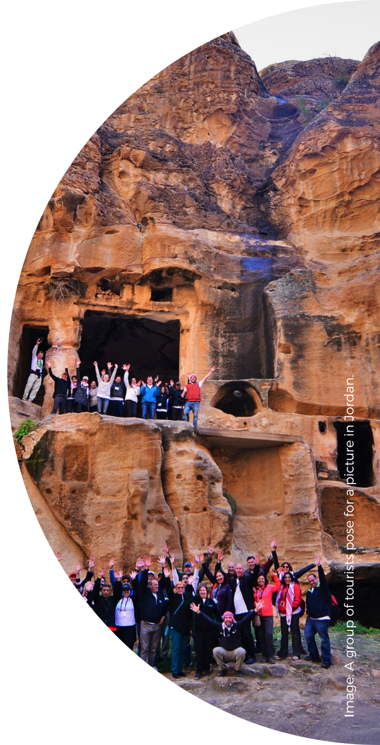
Image: A group of tourists pose for a picture in Jordan.