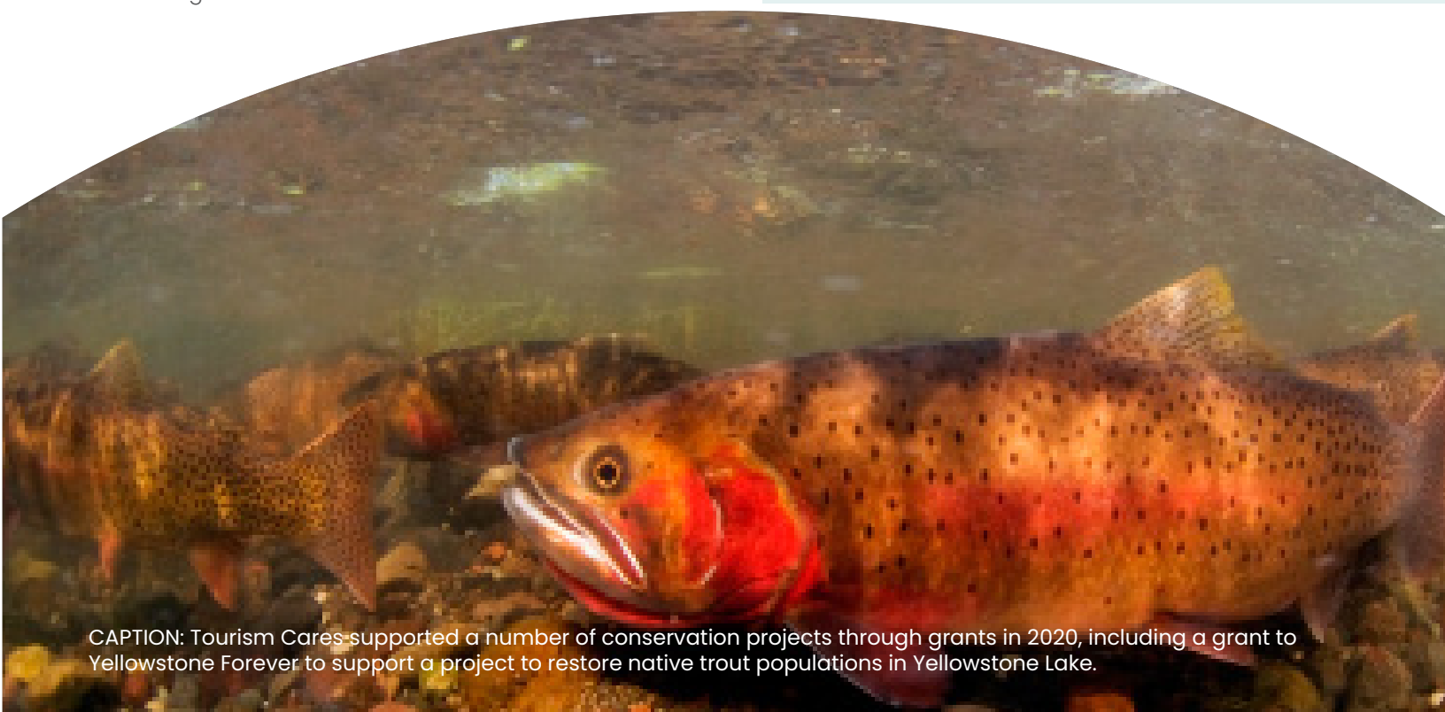
CAPTION: Tourism Cares supported a number of conservation projects through grants in 2020, including a grant to Yellowstone Forever to support a project to restore native trout populations in Yellowstone Lake.