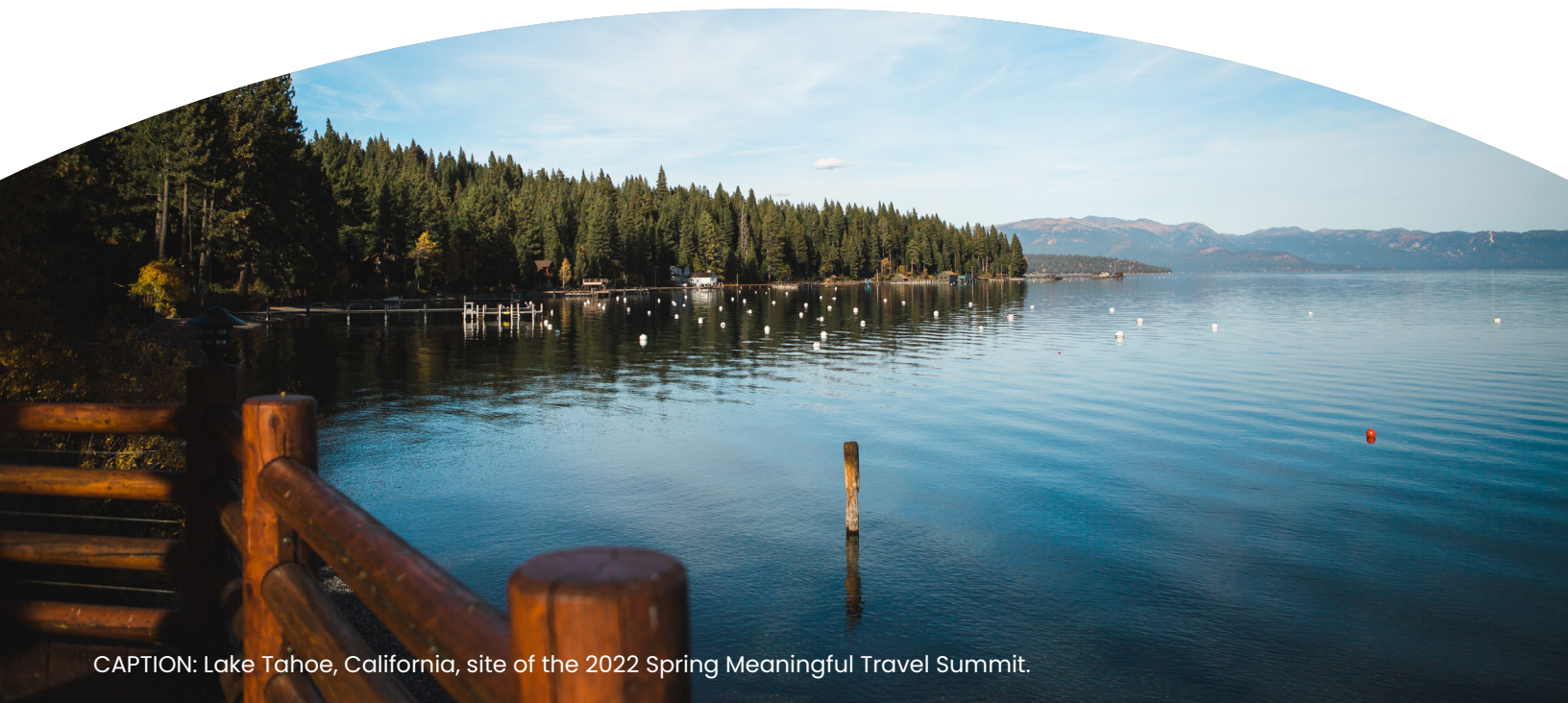
CAPTION: Lake Tahoe, California, site of the 2022 Spring Meaningful Travel Summit.

The tourism industry's greatest asset is the cultural diversity of the destinations and communities it visits. However, the tourism industry workforce is not illustrative of this very principle. Grants directly support programs and activities that increase diversity, equity, and inclusion within travel, build capacity for underrepresented markets and amplify voices representative of the entire travel and tourism industry.