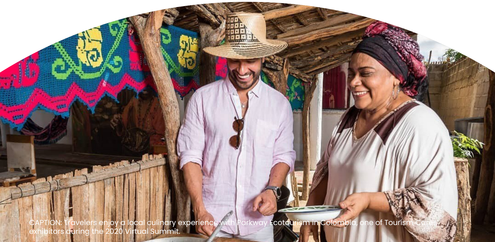
CAPTION: Travelers enjoy a local culinary experience with Parkway Ecotourism in Colombia, one of Tourism Cares exhibitors during the 2020 Virtual Summit.

—Rodrigo Atuesta, Founder, IMPULSE Travel