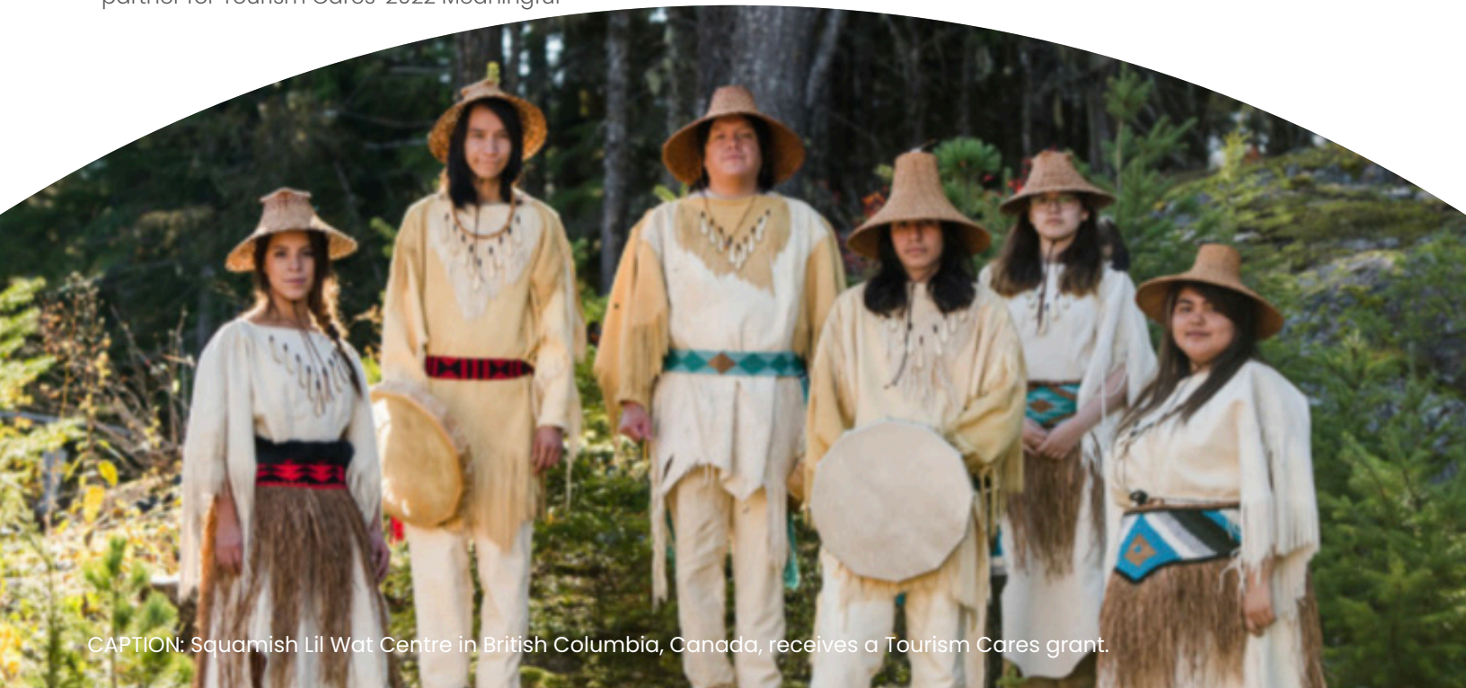
CAPTION: Squamish Lil'Wat Centre in British Columbia, Canada, receives a Tourism Cares grant.

In 2020, Tourism Cares supported organizations all over the world with more than $88,000 in grant funding.