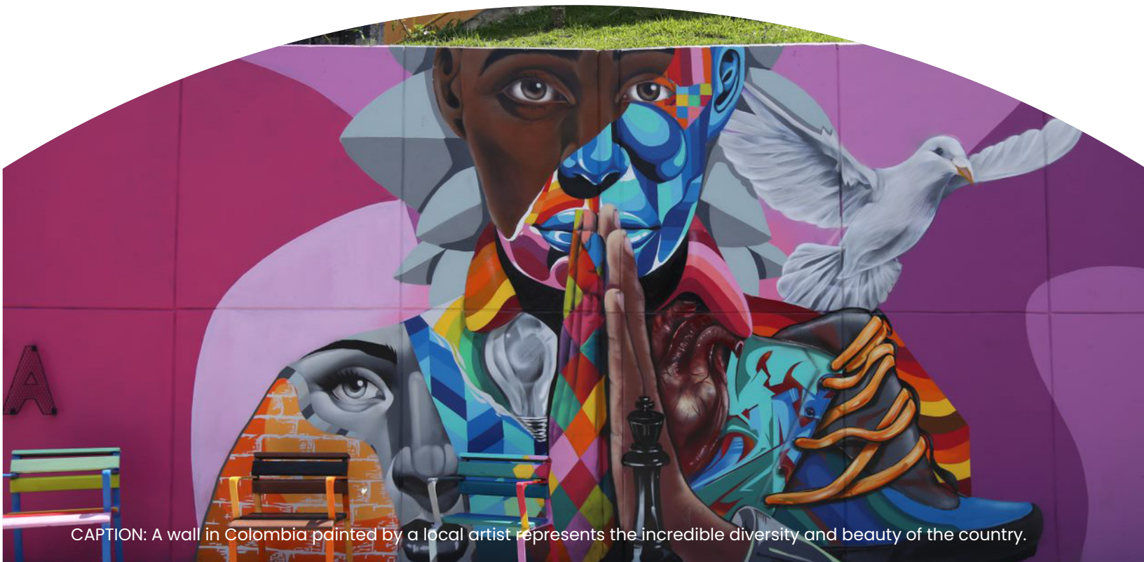
CAPTION: A wall in Colombia painted by a local artist represents the incredible diversity and beauty of the country.

Visit www.tourismcares.org/diversity-and-inclusion