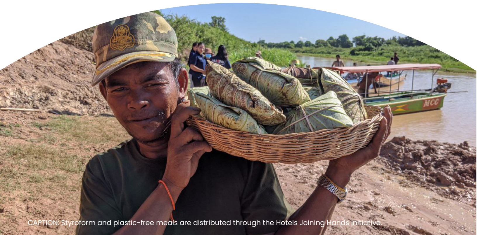
CAPTION: Styrofoam and plastic-free meals are distributed through the Hotels Joining Hands Initiative.

To learn more about our grantees, visit www.tourismcares.org/people-and-impact